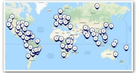
SDA Universities World-Wide

The organization of the Seventh-day Adventists (SDA) comes with rich, world-wide experience in the field of education since the 1870s, establishing educational and medical institutions, globally. The organization's objective in propagating education has its foundation in the philosophy that the youth of the world possess individuality and should be educated to use their abilities and skills to become individuals of principle, qualified for any position of life. As such, it believes in the development of the physical, intellectual, social and spiritual faculties of the individual. It strongly holds that education should change and cultivate every aspect of one's life, equipping and fitting the individual for serving humankind. In a nutshell, SDA education is about the wholistic training and development of the complete being. Currently the organization runs 9,489 educational institutions; 227 hospitals and sanitariums, and; 673 clinics and dispensaries, world-wide.