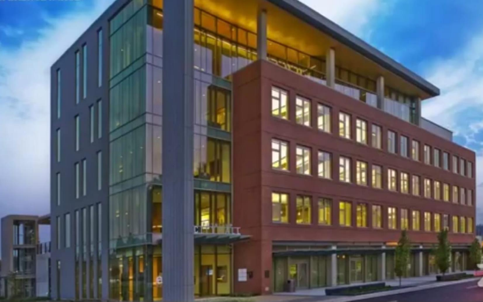
A Reference Image of the Proposed College of Nursing Block to Be Built on the NEAU Campus.